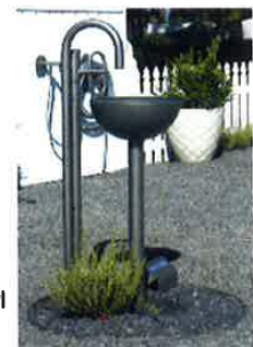
Duo w/Rinse Bowl and Well Ring